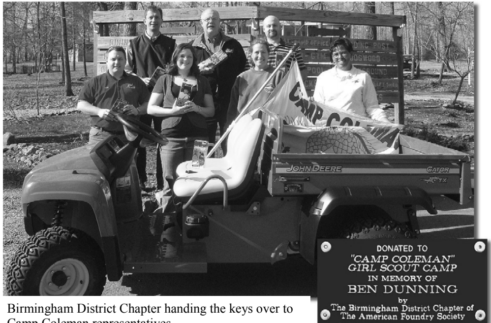
Birmingham District Chapter handing the keys over to Camp Coleman representatives.

The Birmingham District Chapter is pleased to announce the donation of the much needed four-wheeled drive vehicle to the Girl Scouts Camp Coleman. The chapter has been working since August towards raising the funds and delivered the new John Deere Gator to the Camp this past February 19 th . A huge thank you goes out to everyone for the wonderful efforts and kindness – you've done the chapter proud!