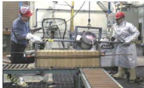
Students pouring Aluminum in the UA Foundry.